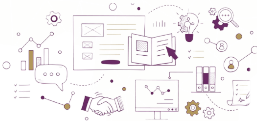
Figure 1: Essence of the Co-creation Concept in Developments